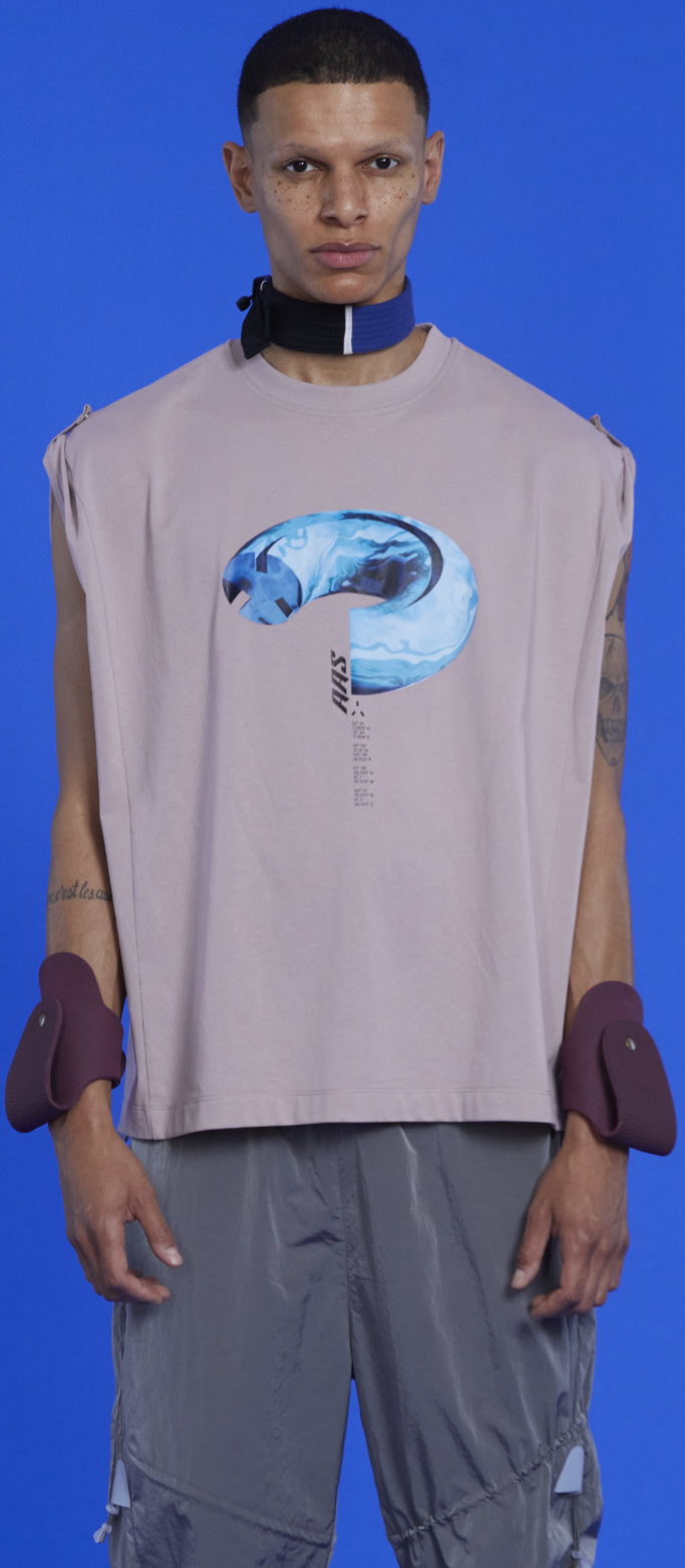
QUESTION TEE ( PRESERVE PINK )