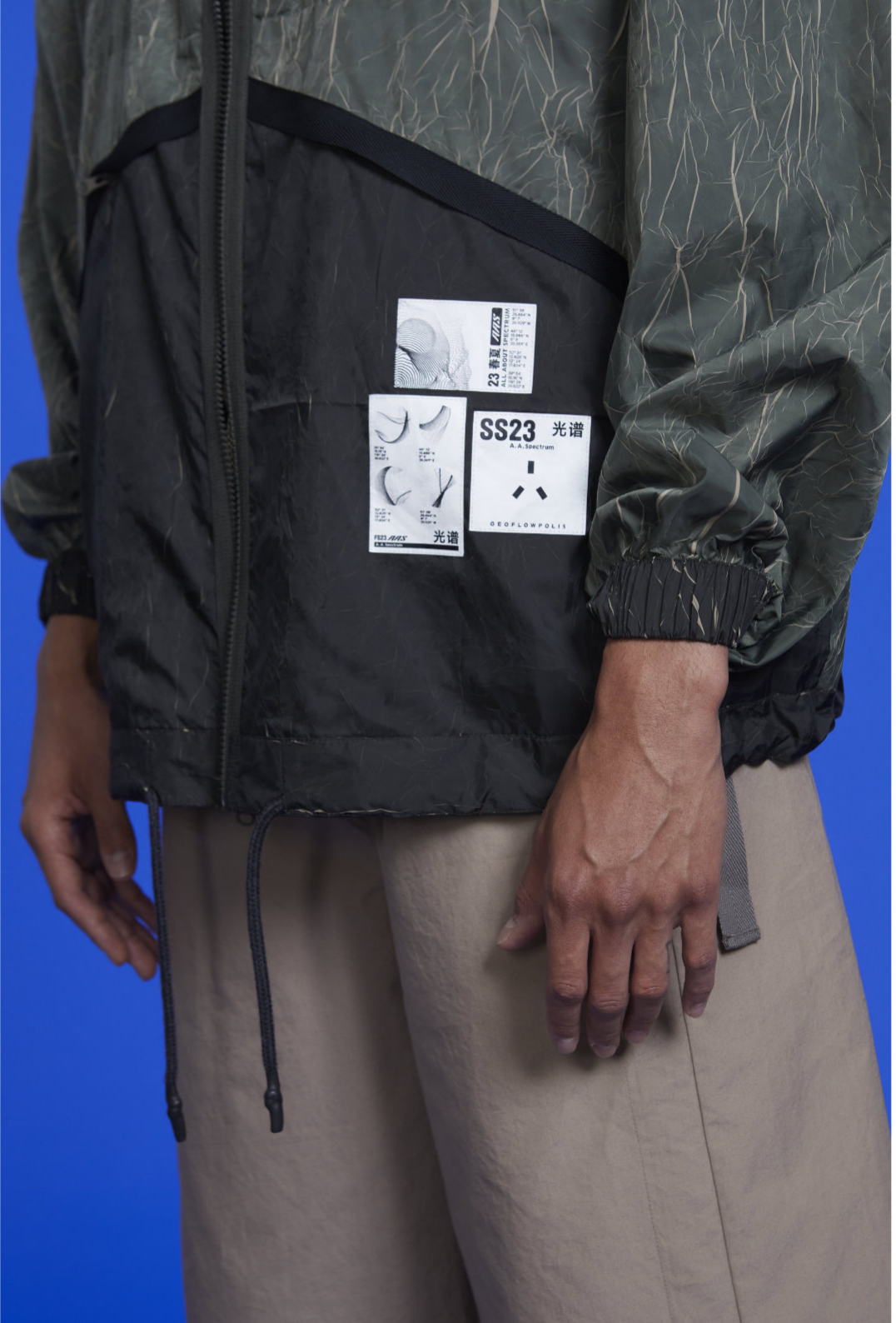
ALLEYCAT JACKET (REVERSED)