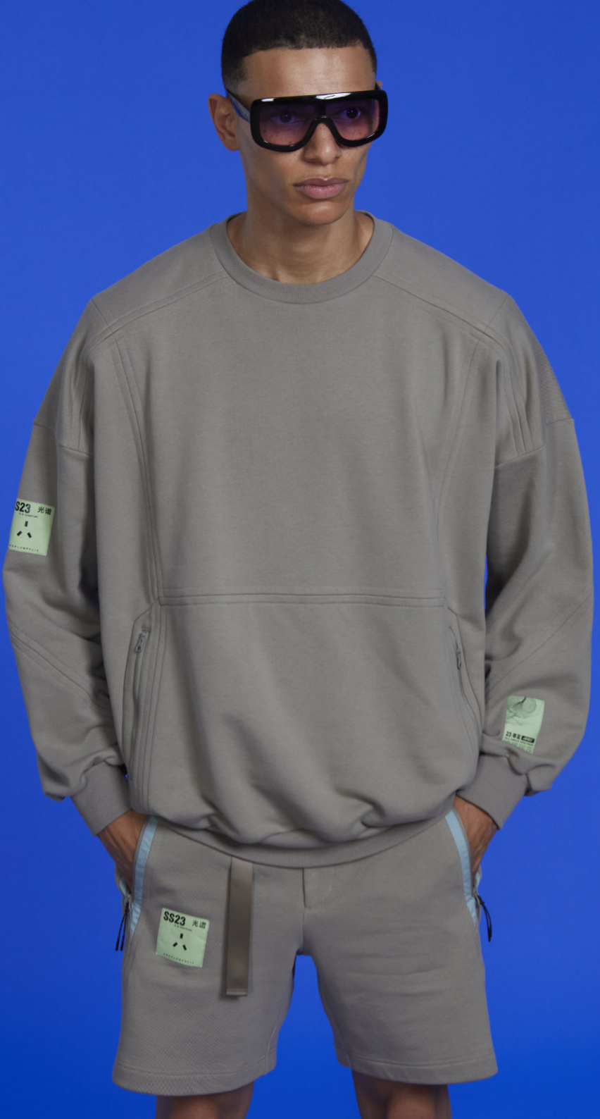
TRACKS SWEATER (CLAY GREY) / TRACKS SHORTS (CLAY GREY)