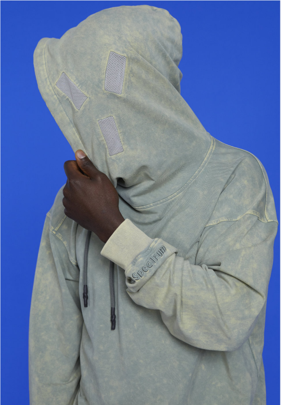
CLOSED CIRCUIT HOODIE (GREEN DUST)