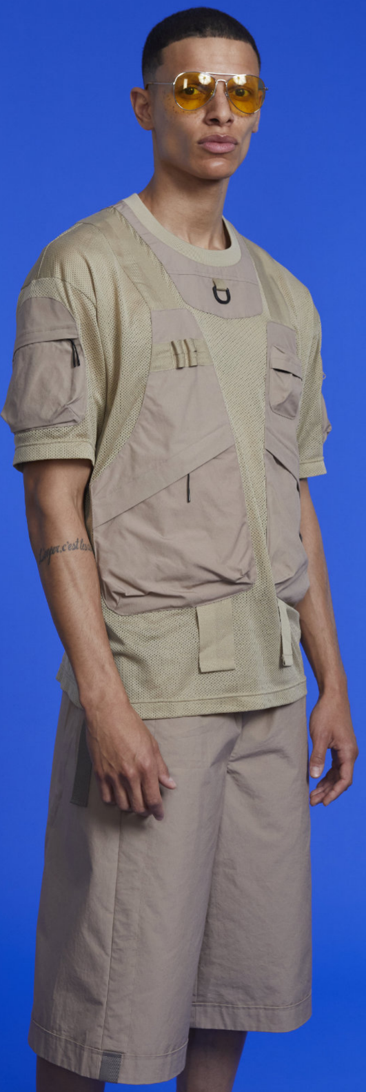
TACTIQUE TEE (SAFARI SAND)