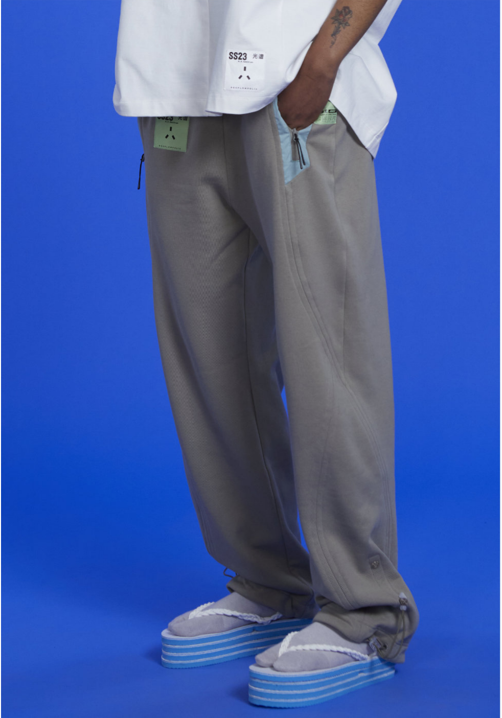
TRACKS PANTS (CLAY GREY)