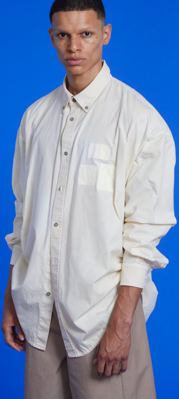
DRESSEN SHIRT (CALICO WHITE)