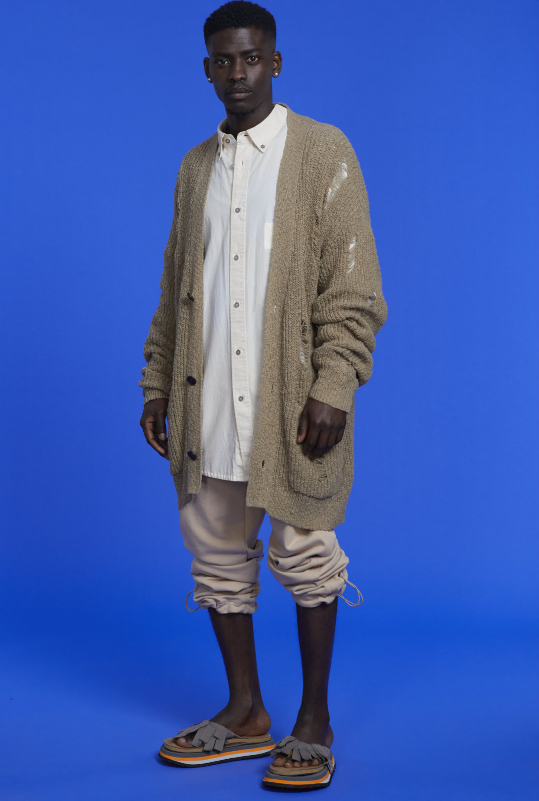
CHANDAIL CARDIGAN (SAFARI SAND)