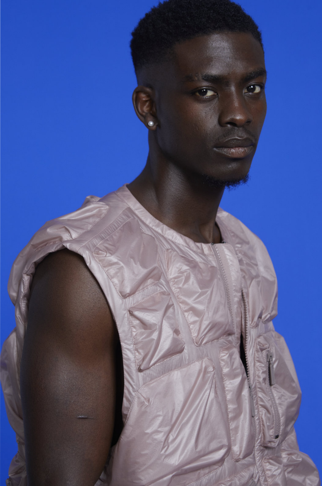
GREAT WALL VEST (PRESERVE PINK)