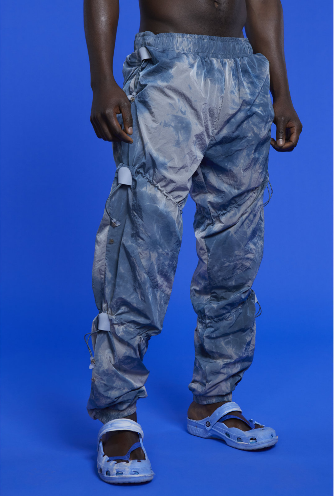
PRESSURE PANTS (TIE DYE BLUE)