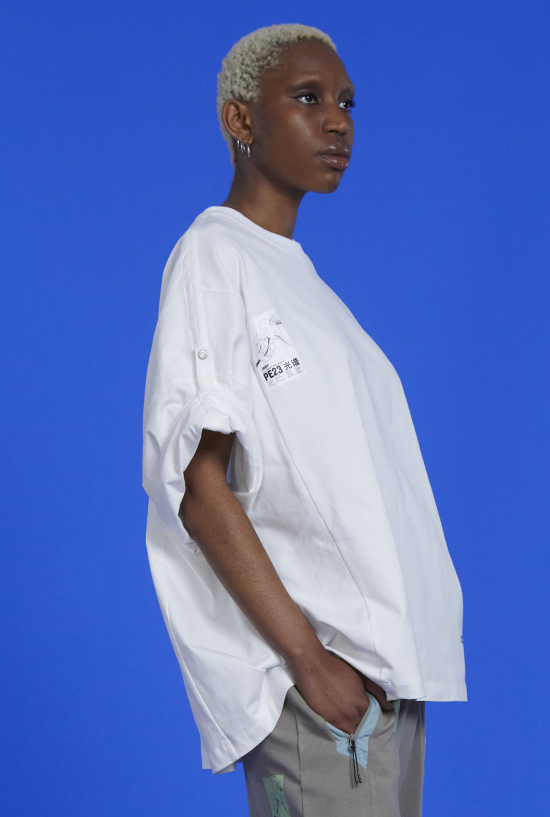
HANGER TEE (WHITE FLAG)