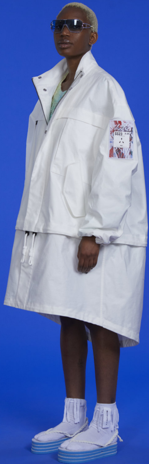
MOD PARKA (WHITE FLAG)