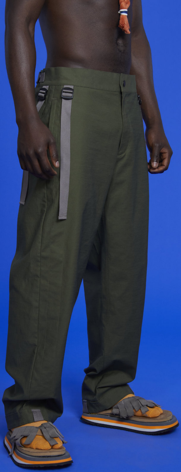
BLINDERS PANTS (CASERNE GREEN)