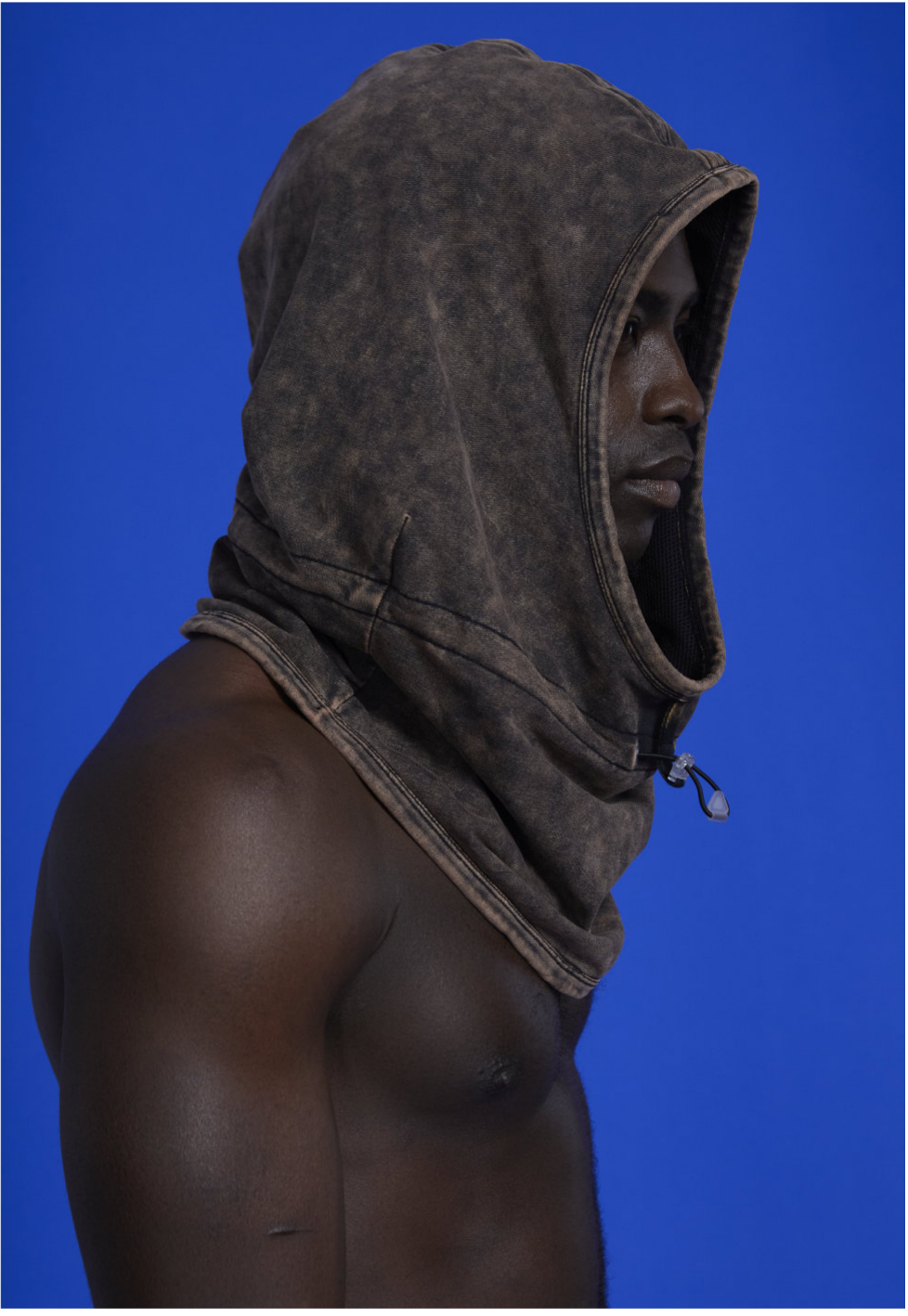
BELADONA KAGOULE (RIDGE BLACK)