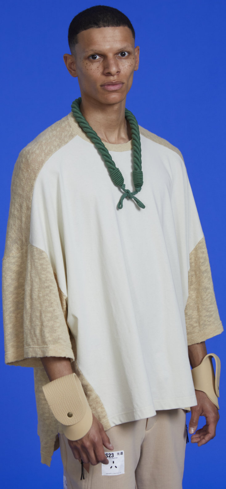
VAPOR TEE (CALICO WHITE)