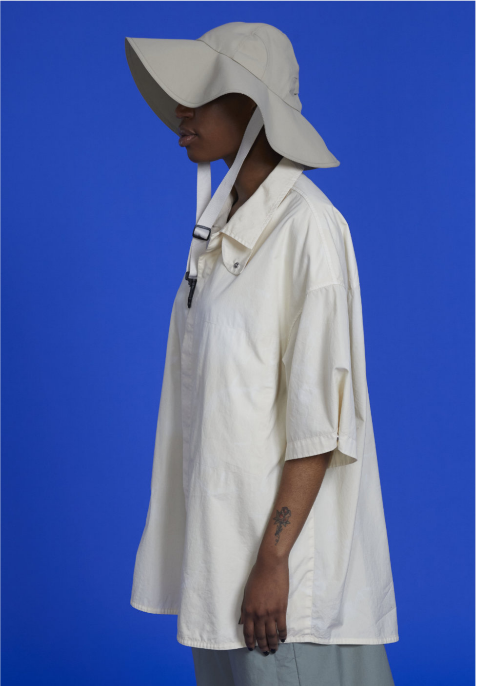
SHORE SHIRT (CALICO WHITE)