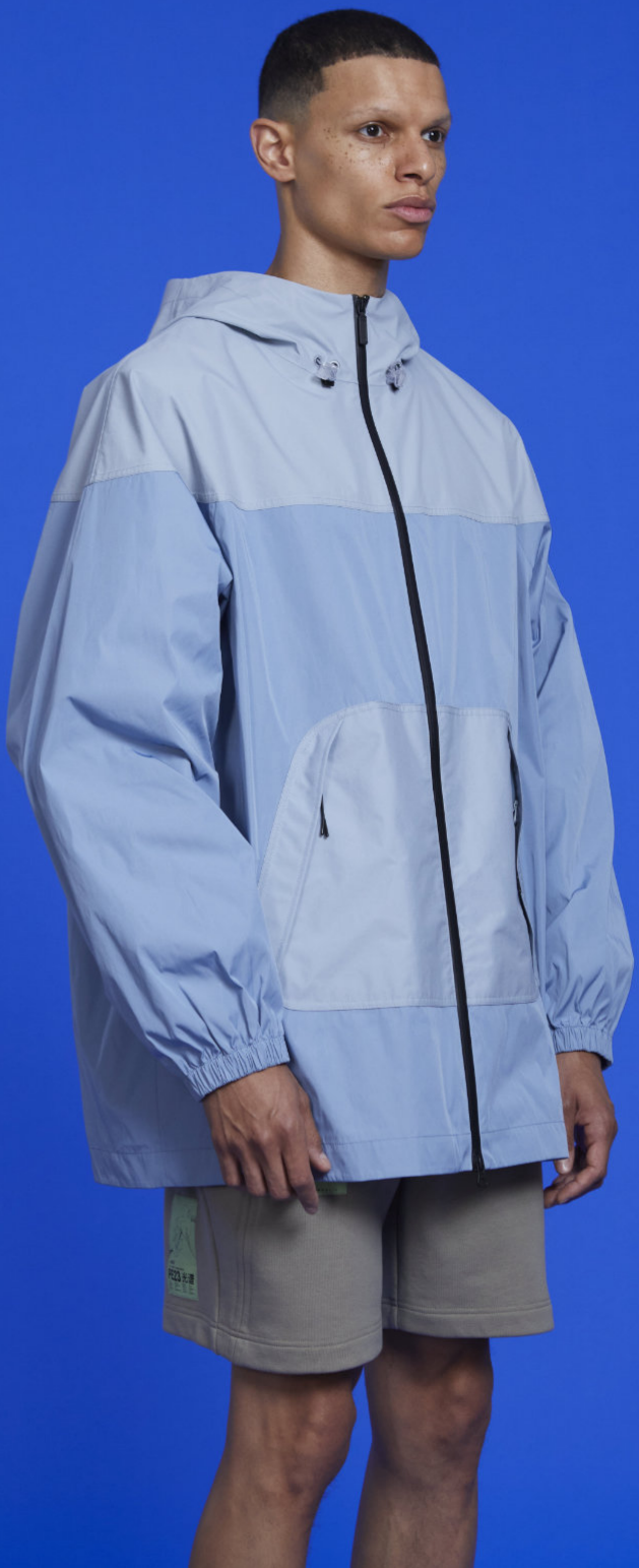
MONTAGNE JACKET ( BLUE WASH )