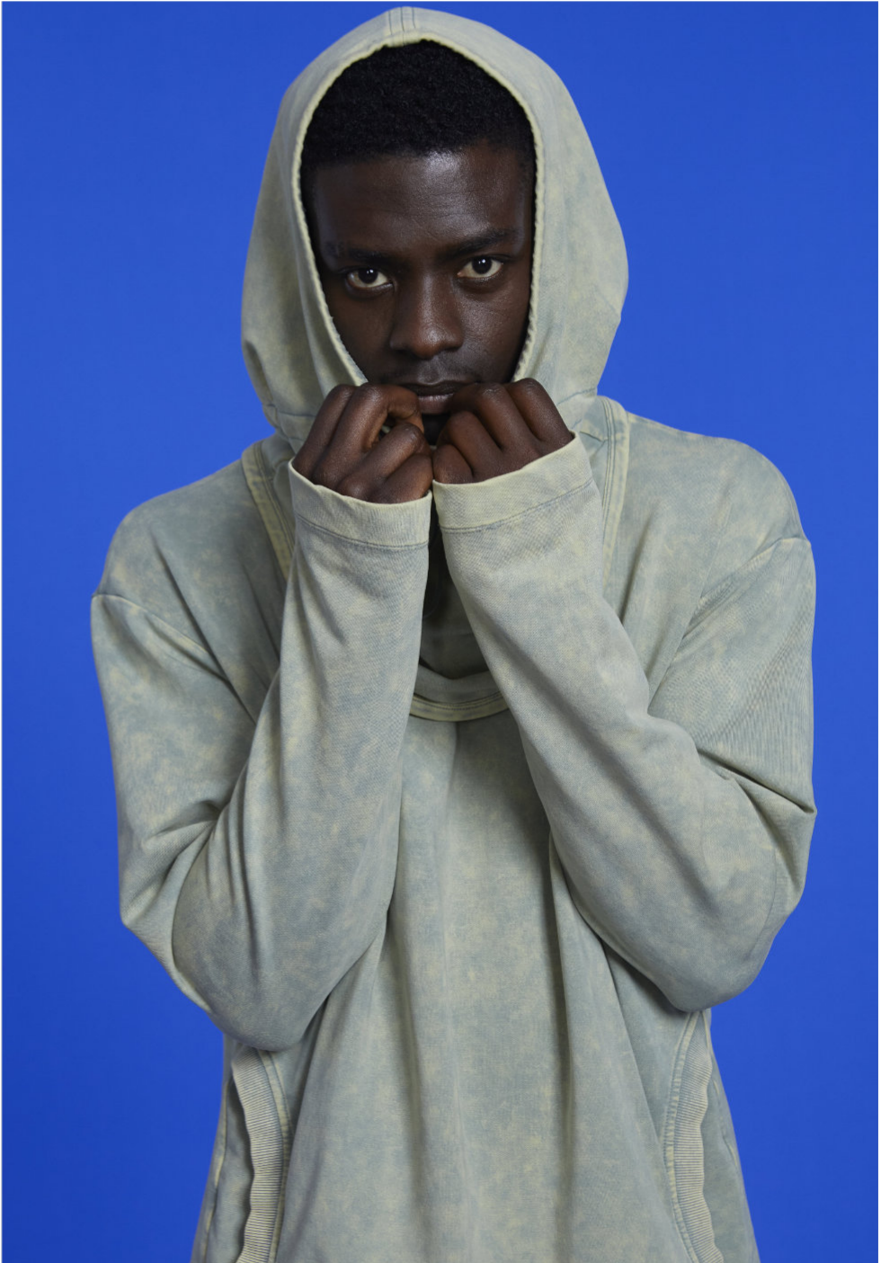
BELADONA SWEATER + BELADONA KAGOULE (GREEN DUST)