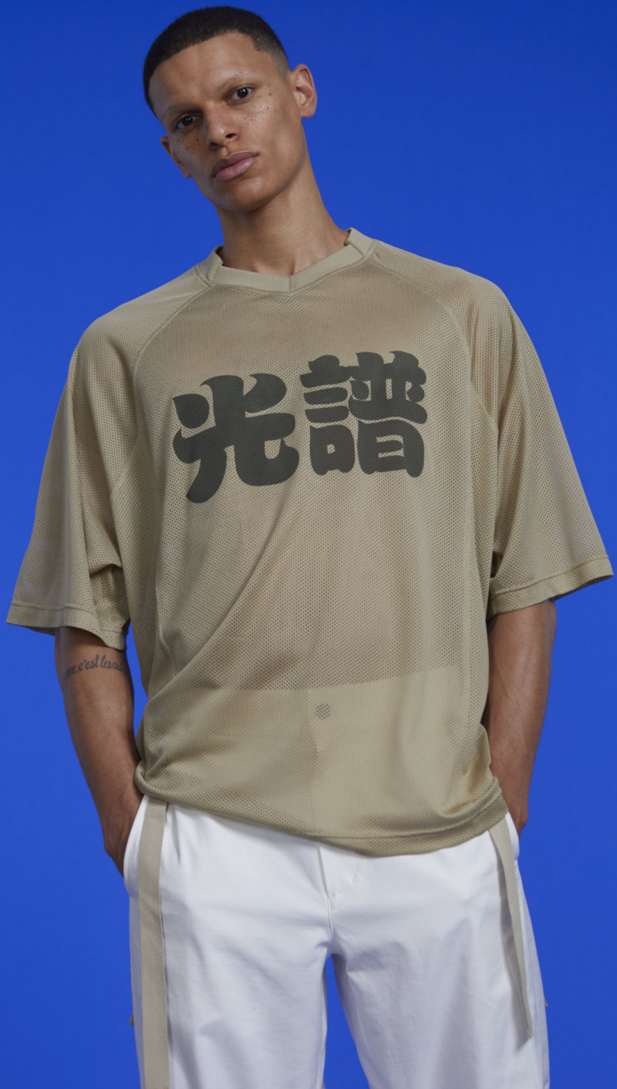
LEAGUE TEE (SAFARI SAND)