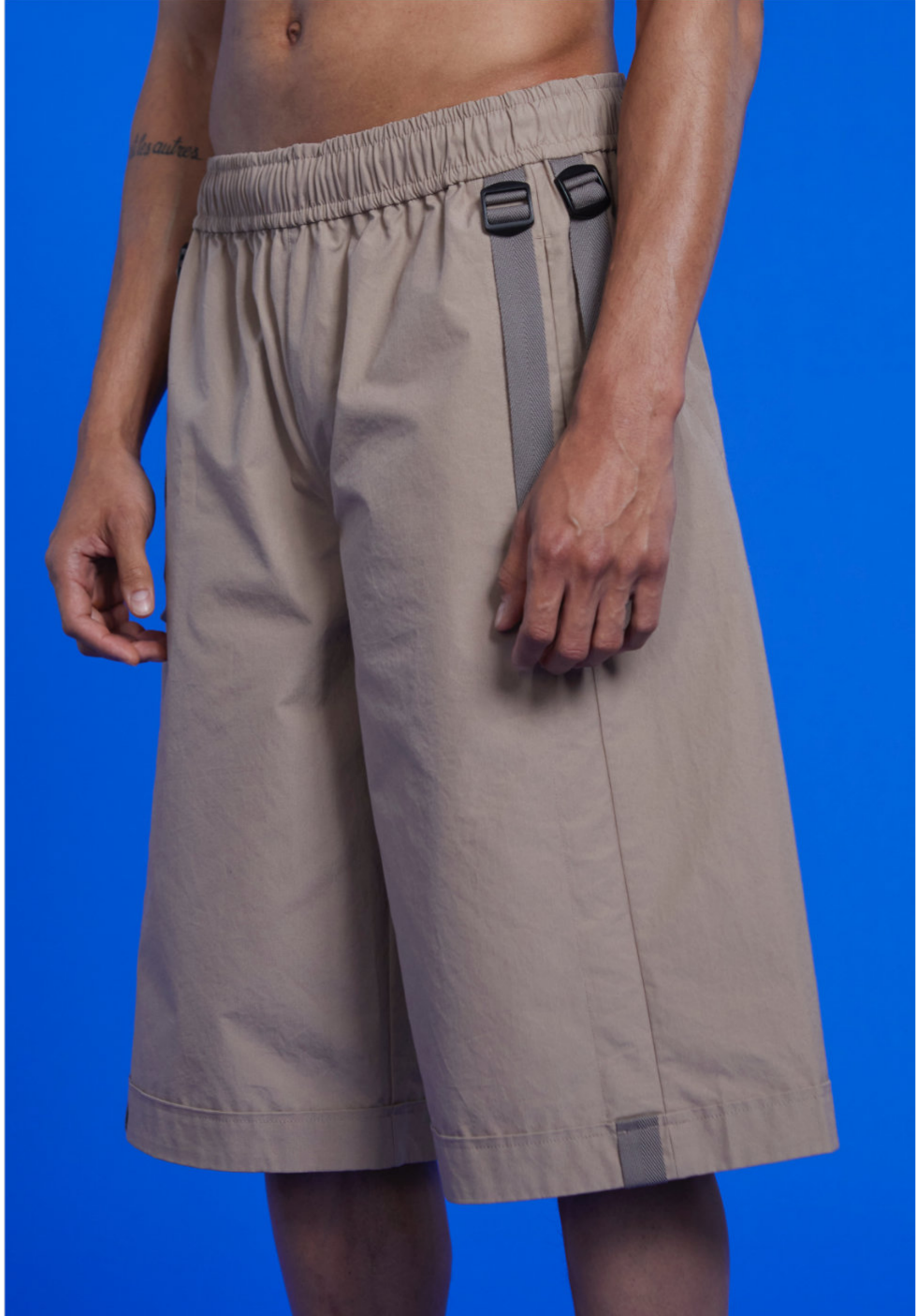
BLINDERS SHORTS (SAVANNA BROWN)