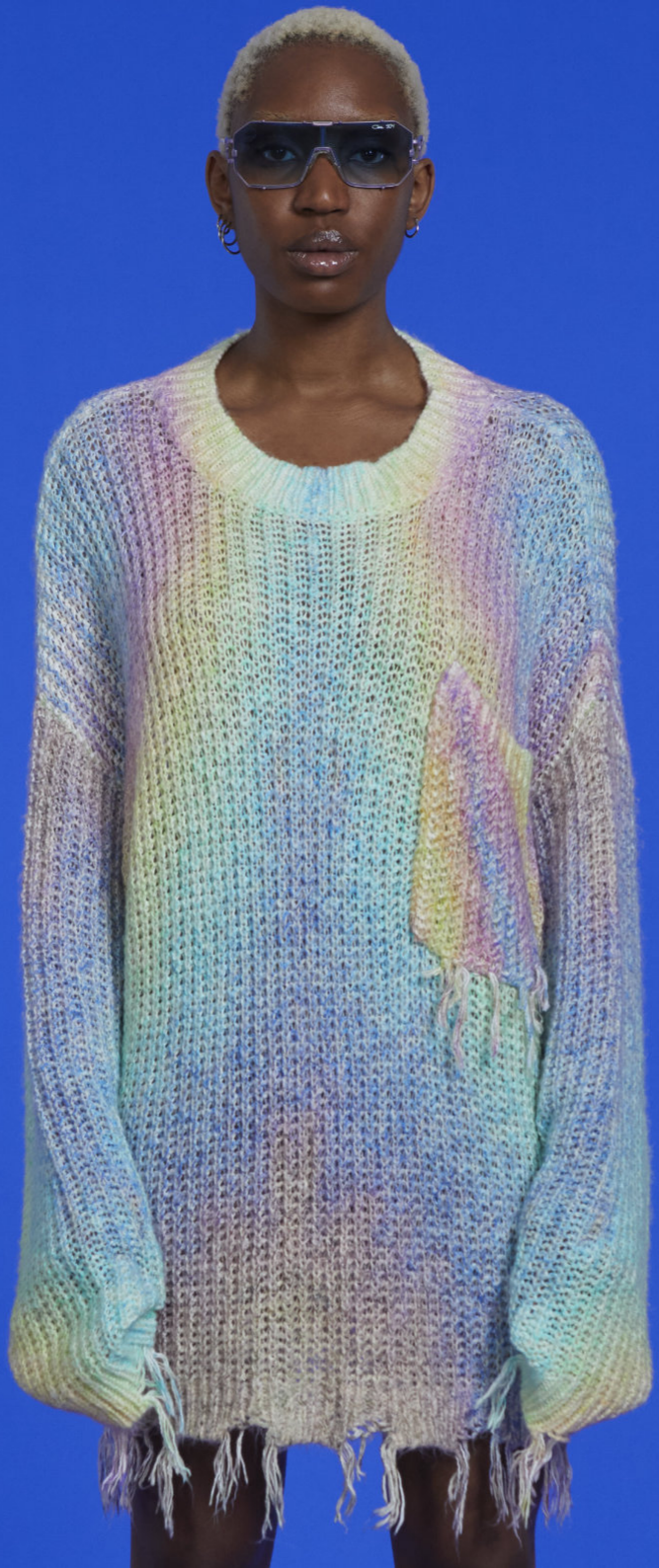
AZURE SWEATER (RAINBOW)