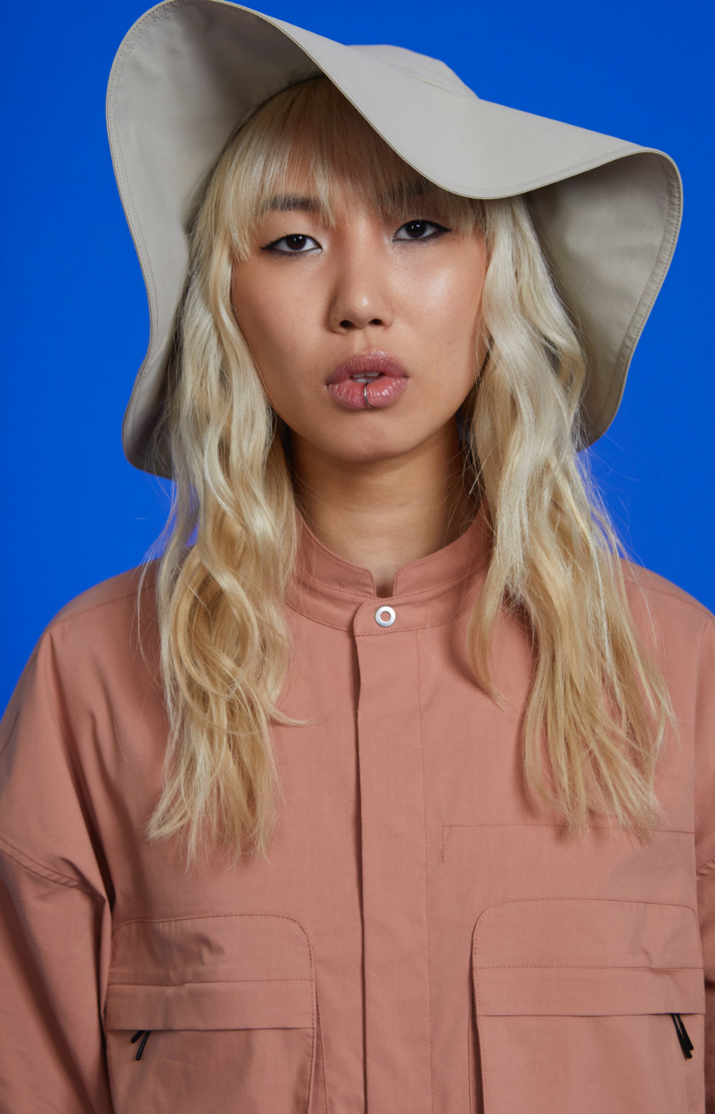
FLIGHT OVERSHIRT (BAKED BROWN)