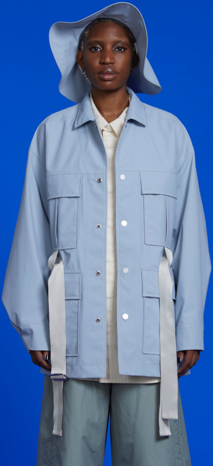
SAFARI JACKET (TANKER BLUE)