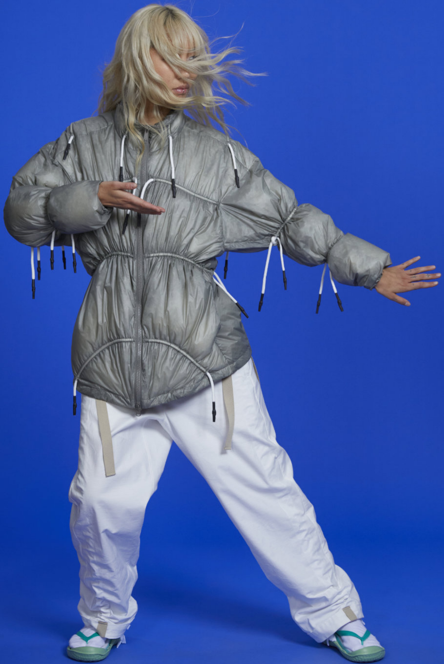
PLUME PUFFER JACKET (CLAY GREY)