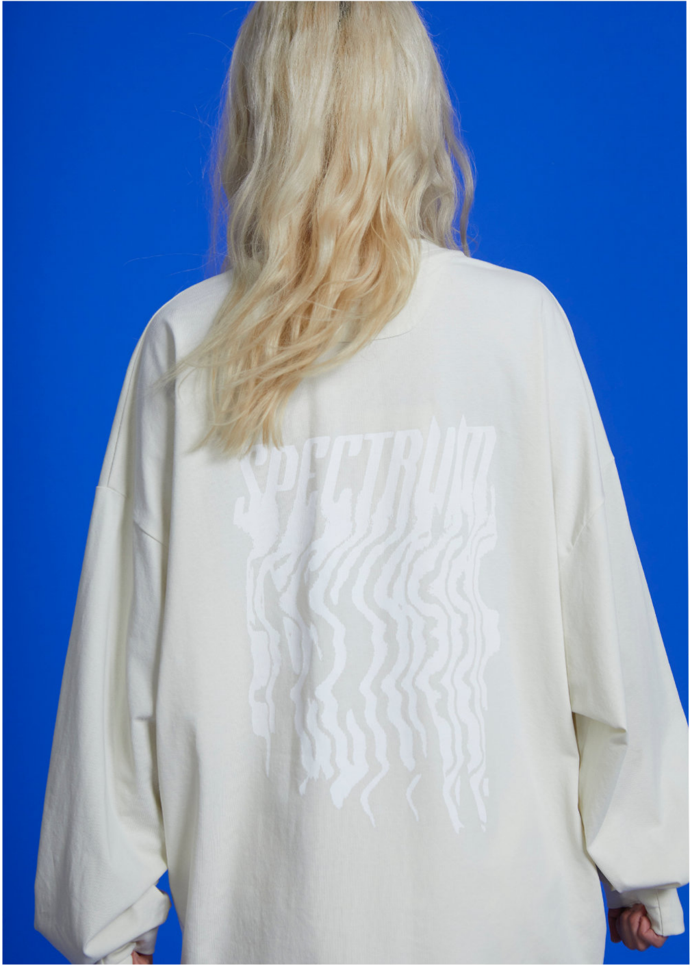
COBAR L/S TEE (CALICO WHITE)