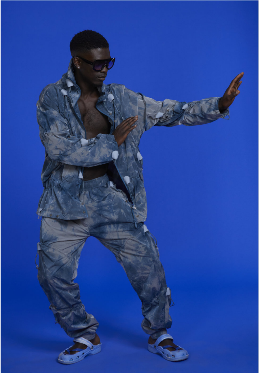
PRESSURE JACKET (TIE DYE BLUE)