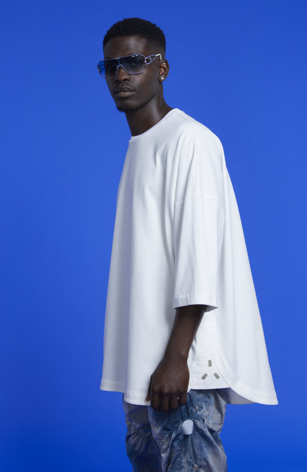
MUTINY TEE (WHITE FLAG)