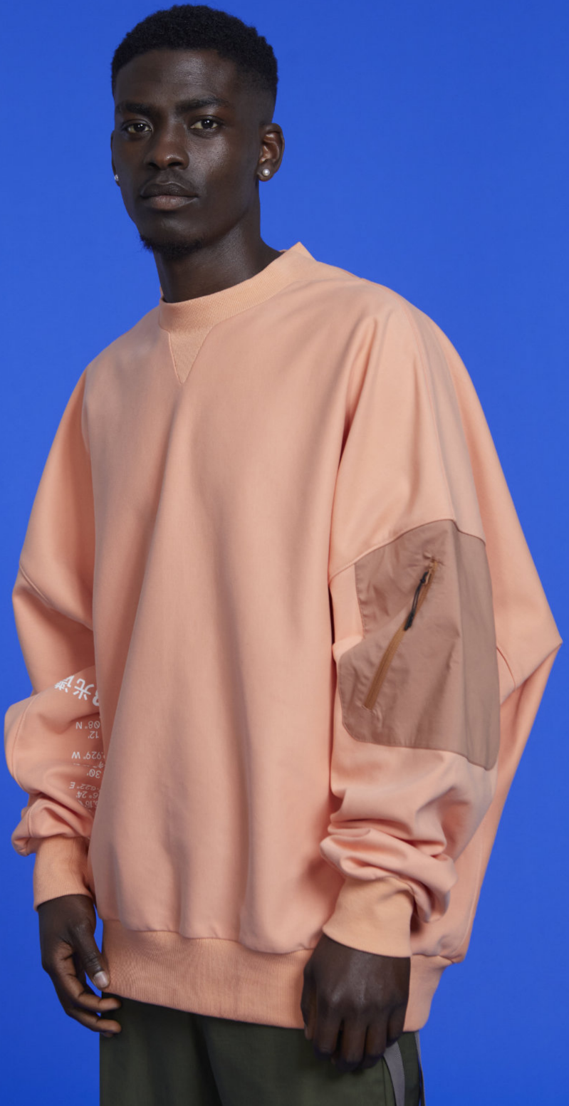
GEOFLOW SWEATER (CORAL RED)