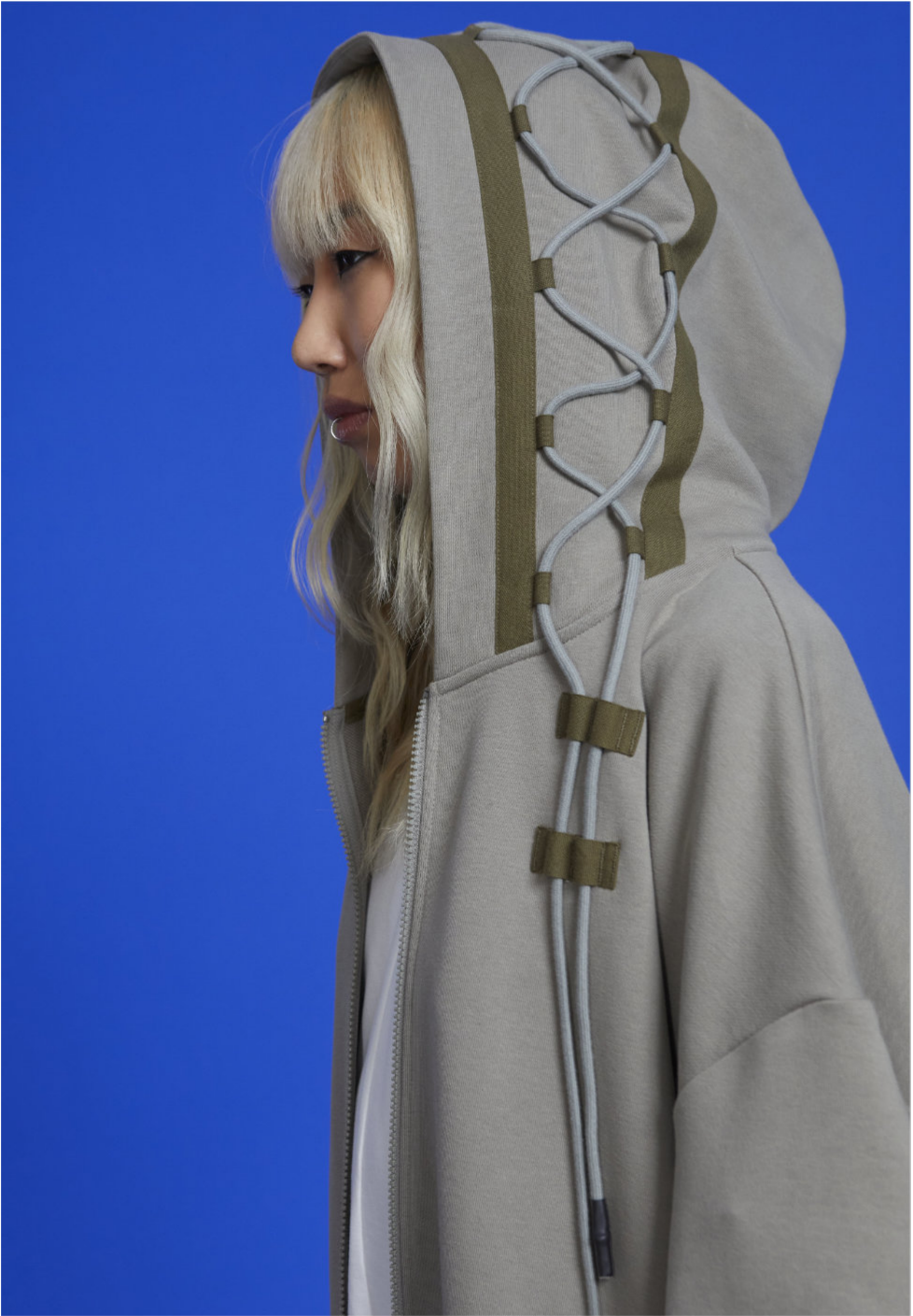
GRAVITY HOODIE (CLAY GREY)