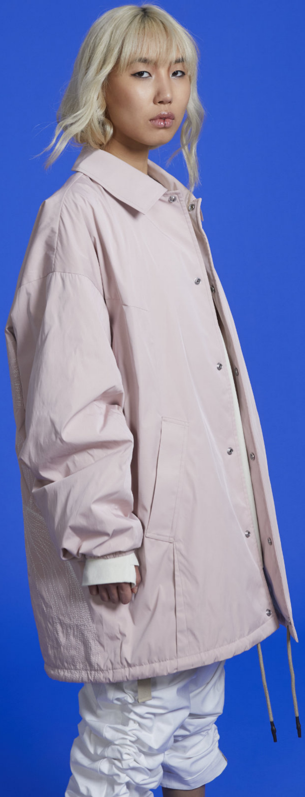
FLOWCOACH JACKET (PALE PINK)