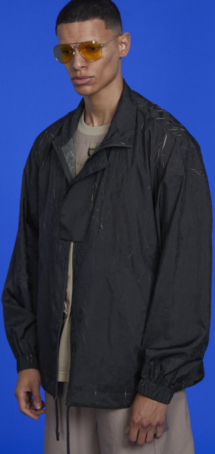
ALLEYCAT JACKET (DEEP BROWN)